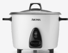
Pot-Style Rice Cookers