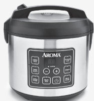
Multicookers/ Rice Cookers