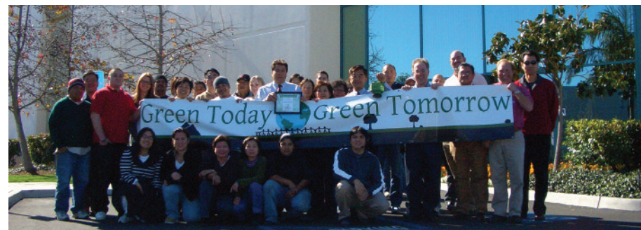
The Aroma Wellness Co.'s San Diego staff

Aroma Wellness™ Co. is committed to making the world a healthier, happier place for current and future generations. We believe that being socially and environmentally responsible is a compulsory duty for modern businesses. Our mission is to provide innovative home product solutions that bring health and wellness into the lives of all who use them. The NutriWare™ line of kitchen appliances is in lockstep with Aroma Wellness™ Co.'s overall mission.