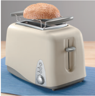
Bun Warming Rack: