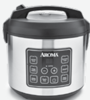
Multicookers/ Rice Cookers